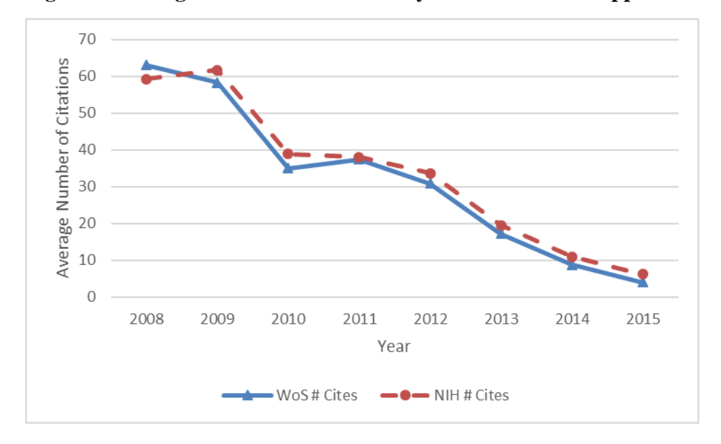
Figure 1. Average Number of Citations by Year of ACTSI-Supported Publication